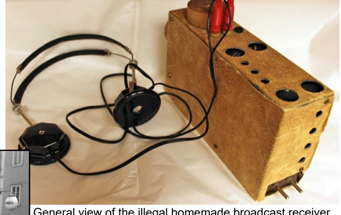
General view of the illegal homemade broadcast receiver complete with original headphones and aerial.